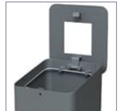
Bag holder inner ring.