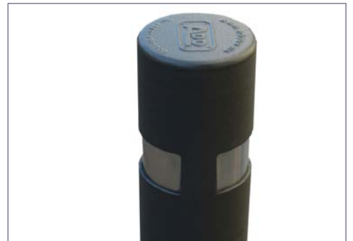
Bollard reinforcement detail avoiding top break.