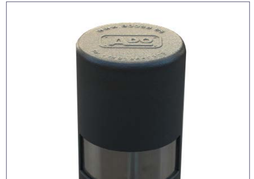
Engraved detail of the logo on the bollard.