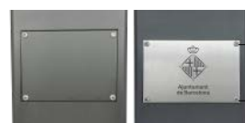
Opening in lacquered or stainless steel with customisation.