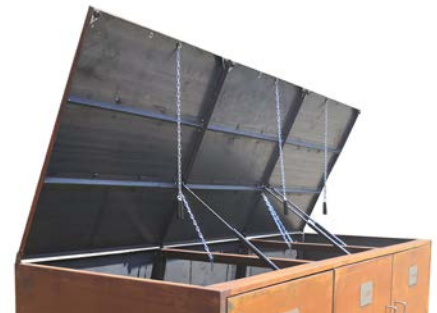
Opening detail upper folding lids covers containers.

The container covers provide a good image by managing to have an area reserved for the containers, thus avoiding the change of their location. Ideal for ECO recycling points.