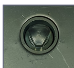
Triangular key lock detail.