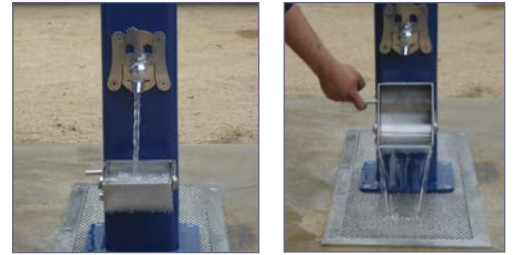
Detail lower tap and later emptying of the trough for animals.