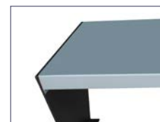
Smooth sheet metal