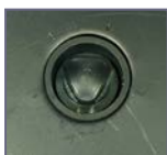
Triangular key lock detail.