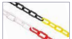
Ref. CP825RB Ref. CP825AN