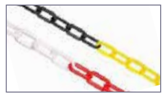
Ref. CP825RB Ref. CP825AN