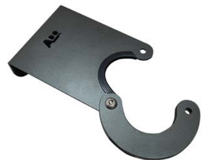
Loner scooter rack opening detail.