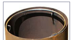
Bag fastening ring.