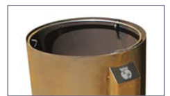
Bag holder inner ring.