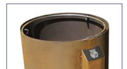
Bag holder inner ring.