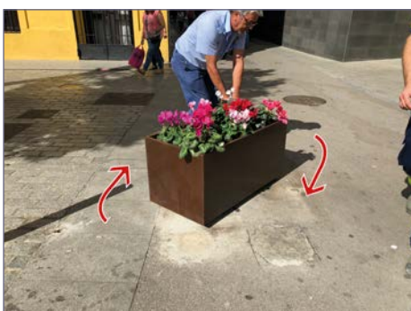
The planter rotates 360°, being able to choose the travel at the time of installation.