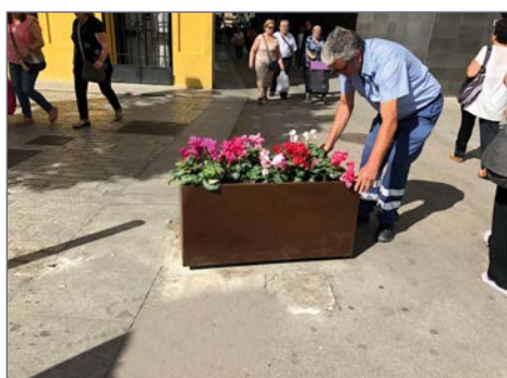
Detail of the blocking of the planter in the final point.