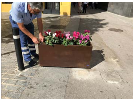
Detail of the opening of the blocking of the planter.