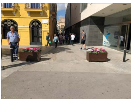
Planters in open position to allow the passage of vehicles.

Anti-moon security planter specially built to resist the vandalism of vehicles landing on the moon.