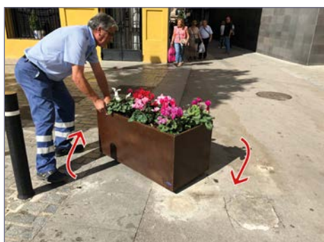
Start of the planter turning system.