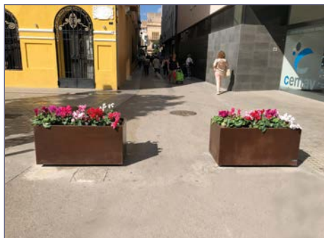
Planters in closed position avoiding the vehicle passage.