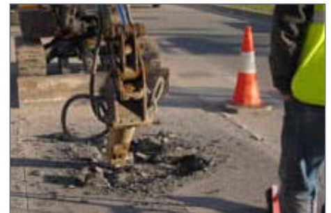
Chop the surface.