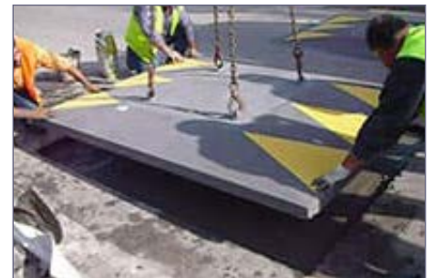
Install the monobloc piece.