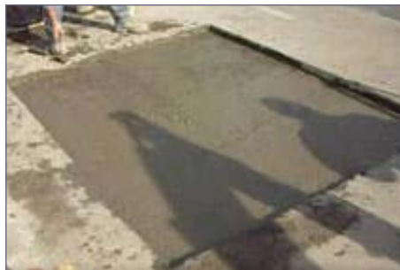
Fill surface with concrete.