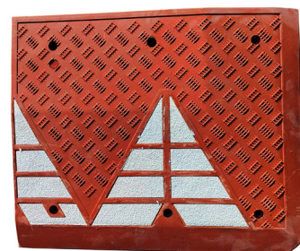
End piece: 900x750x65 mm