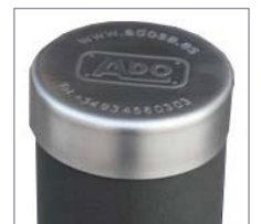
Tap bollard upper part detail.