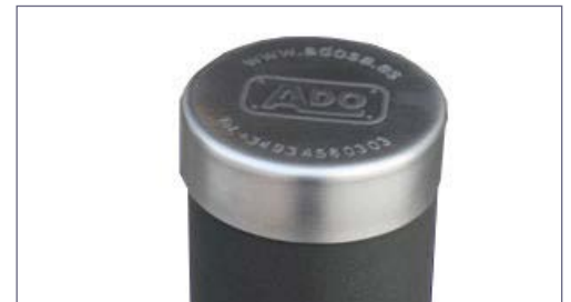
Bollard upper part detail.