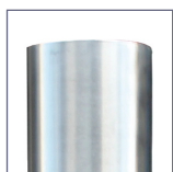
Satin finish option.

Diameter: \varnothing 90 / 104 / 204 / 220 mm. Height: 800 mm. Thickness: 2 mm.