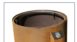
Bag holder inner ring.