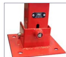
Optional: triangular key.