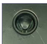
Triangular key lock detail.