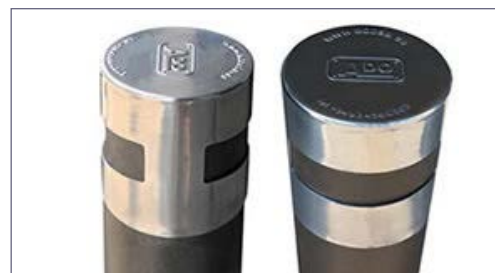
Bollard upper part detail.