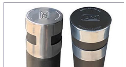
Bollard upper part detail.